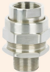
Steel pipe wiring